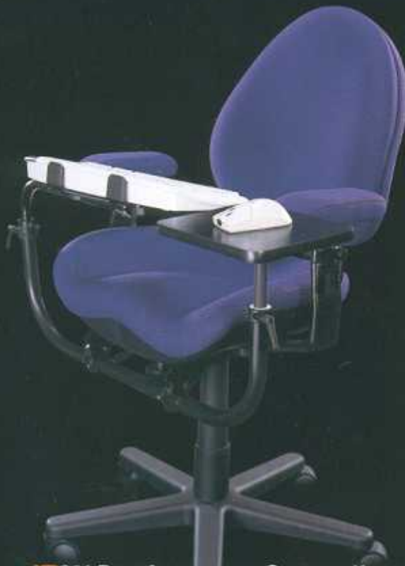
XTC01 BASE ASSEMBLY FOR STANDARD KEYBOARD XT002 ADDITIONAL RISER WITH XTM01 MOUSE PLATFORM (9" x 8") (shown here with the J757-A-H model Task Chair)