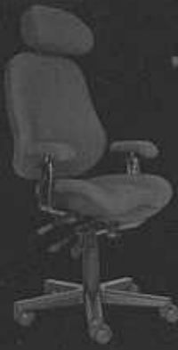
MANAGEMENT & EXECUTIVE