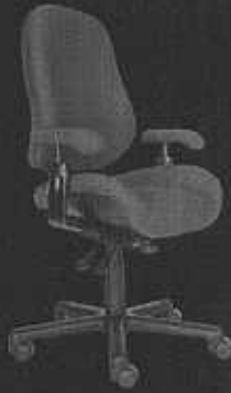
BIG & TALL