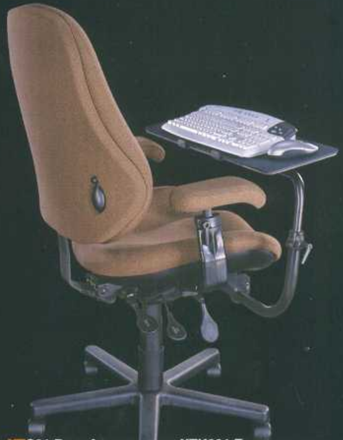
XTC01 BASE ASSEMBLY WITH XTK001 EXTENDED KEYBOARD PLATFORM (26" x 8") (shown here with the K2507-A-H Management Chair)

Extend the ergonomic comfort of your workstation, and end neck and shoulder tension with BodyBilt's exclusive X-Tension™ Arm accessories! The X-Tension™ Arm is a fully adjustable work surface that attaches directly to each BodyBilt chair. The various models and options shown here provide surfaces for a laptop, keyboard and mouse, writing, and even a court stenograph machine.